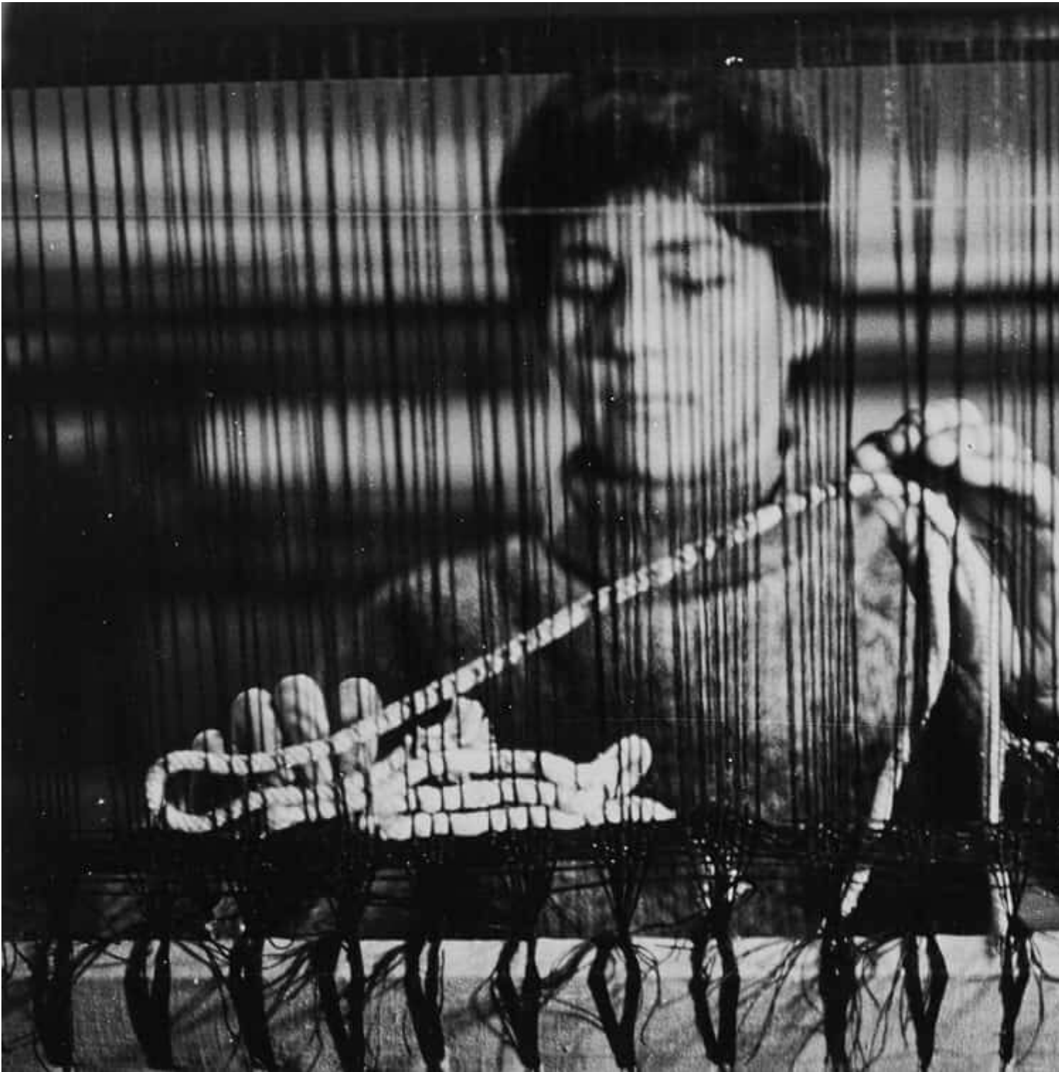
Magdalena Abakanowicz weaving in her studio

In her later years Abakanowicz's imagery became increasingly figurative, and she moved beyond weaving into a wider pool of sculptural materials. Yet the same fibrous, woven texture was always there, a reminder of her deep